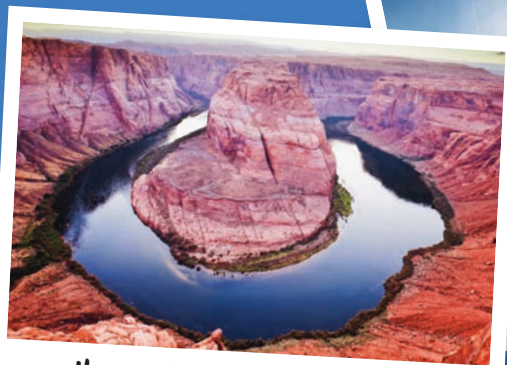
Horseshoe Bend at Dusk