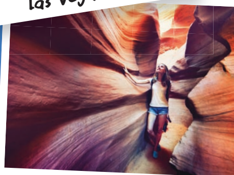
Lower Antelope Canyon