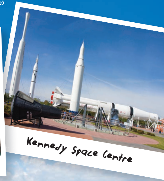
Kennedy Space Centre