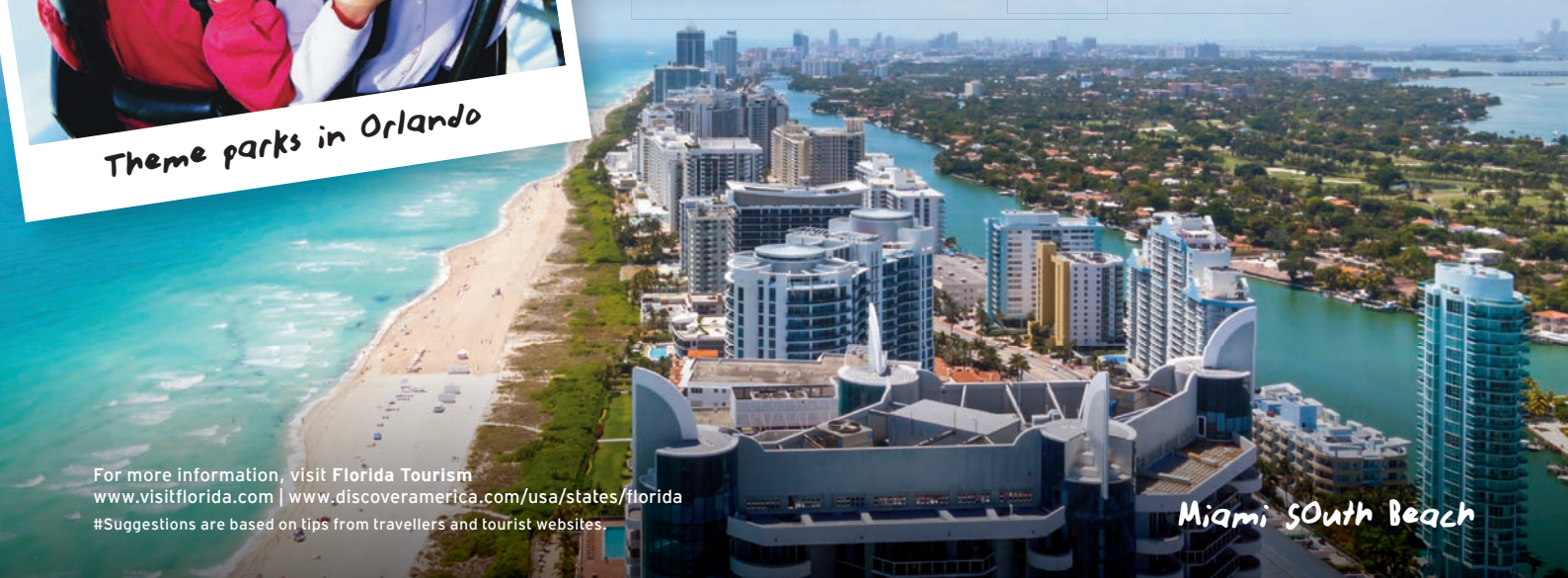
Miami South Beach