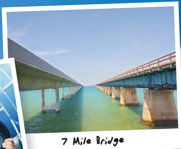
7 Mile Bridge