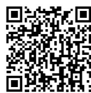
Left and Right Hand Driving Matrix

Created specially for Asian drivers, this is an essential guide for frequent self-drive travellers. Scan the QR code below and access our online Left and Right Hand Driving Matrix to 50 popular destinations around the world!