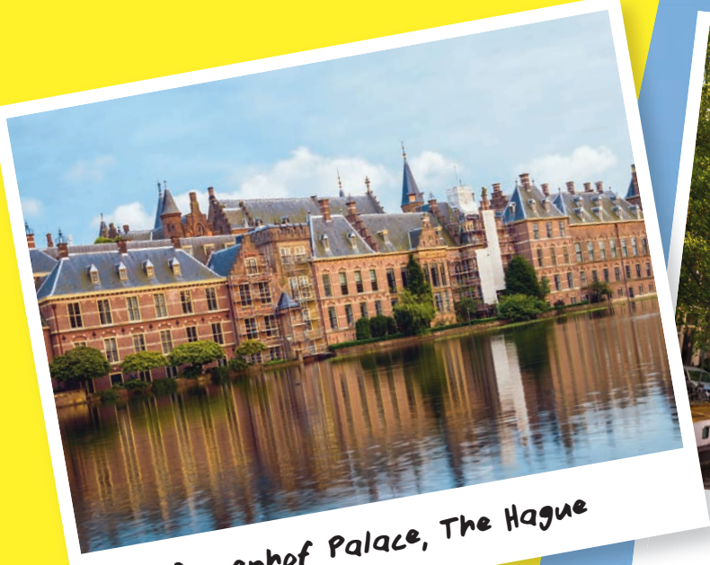
Binnenhof Palace, The Hague