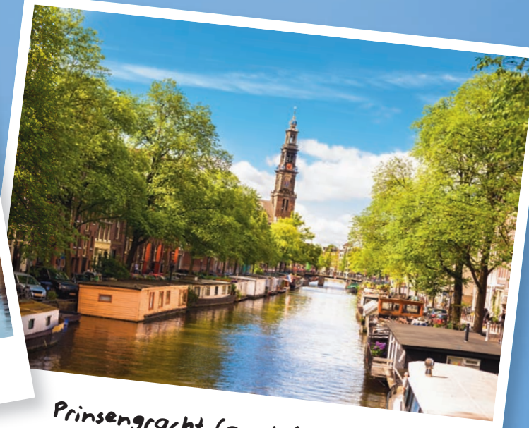
Prinsengracht Canal, Amsterdam