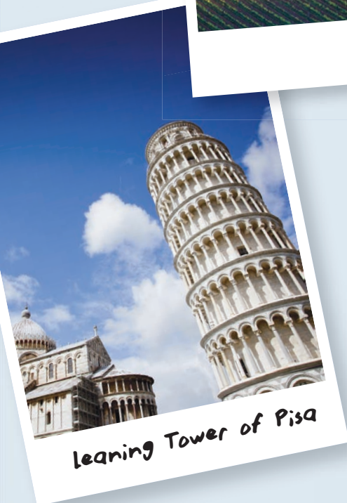
Leaning Tower of Pisa