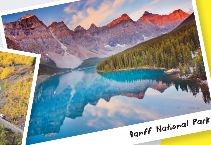
Banff National Park