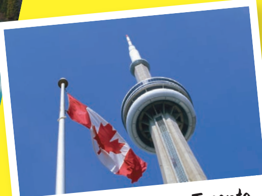
CN Tower Toronto

Visit www.hertz.com/drivingmatrix to find out which side you are driving.