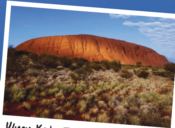
Uluru-Kata Tjuta National Park