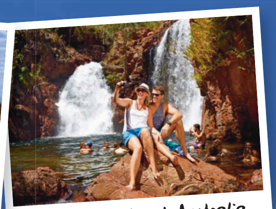
Selfie in Outback Australia