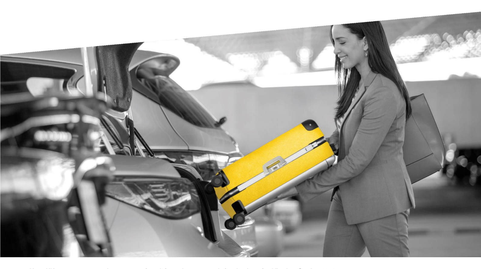
Hertz UK cannot guarantee the accuracy of any information presented after the date of publication. October 2021

Diversity is at the heart of our business. It's a way of thinking. It's an assortment of different thoughts, beliefs, and ways of living. We believe in equality for everyone, regardless of race, age, gender, gender identity, ethnicity, religion, or sexual orientation.