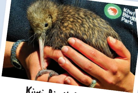
Kiwi Birdlife Park