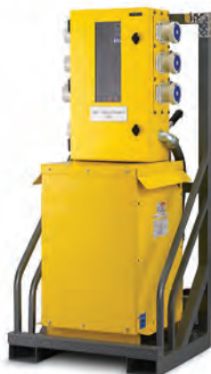
30 KVA Dolly Panel