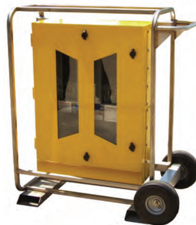
600A I-Line Panel