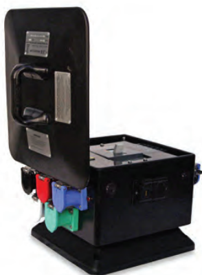
160 - 400A Adjustable Breaker Box