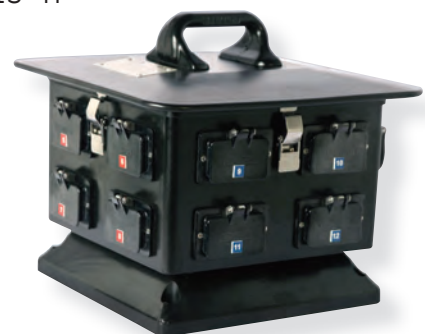
100A CAM to Edison Box